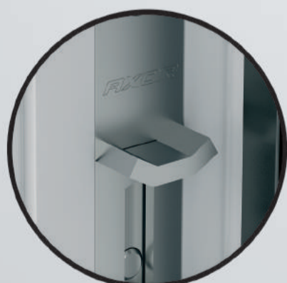
Sash lifter Excludes sash drooping in the "closed" mode