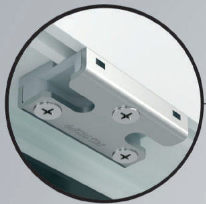
Safety locking plate Increases break in properties of the window