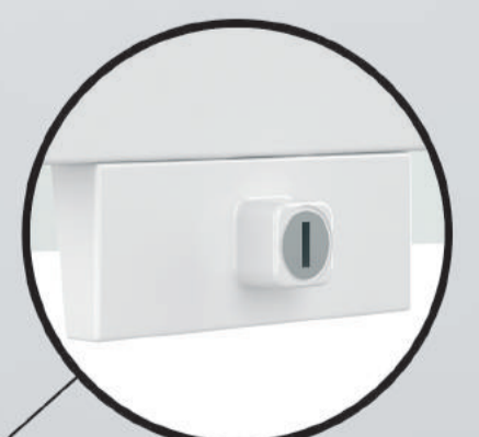
Child security lock Allows preventing window opening by the little children