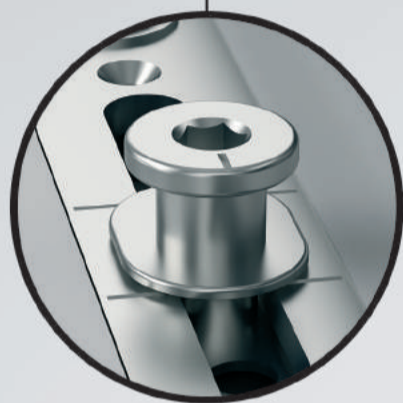
Mushroom pin Makes it difficult for the burglars to open the window