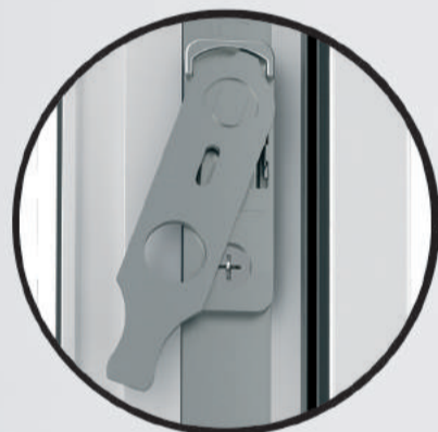
Wrong operation safety device Provides for the comfortable window closing and blocks false opening