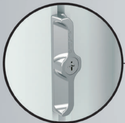
Locking plate Locking plates are produced of a special wear-resistant alloy (copper, aluminum, zinc). The wear at 30 thousand opening cycles does not exceed norms of DSTU and GOST