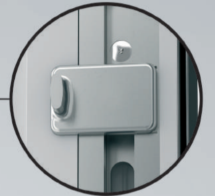
Step-by-step opening Allows opening the window in a desired position to create ventilation with a fixed gap from 12 to 20mm